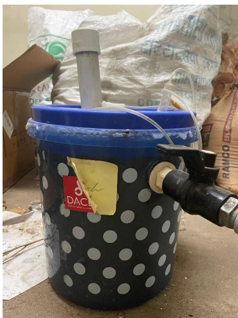
Figure 3: Prototype Plant 2

To assure bacterial development, this plant was once more fed with cow dung slurry. After five days, I observed that there was no gas build up in the plant. While checking for leaks, I identified a small leak in the waste inlet tube as the probable cause. The leak was sealed, and the plant design was modified whereby a PVC cap was fitted onto the inlet tube (to prevent air entry or gas escape) and all tubes were re-sealed. The plant was then fed again with slurry. After five days, a small gas buildup could be seen. Although the balloon did not inflate, a rudimentary flame test – placing a lit match at the outlet of the outgoing gas pipe and seeing if the flame became larger when the outlet was opened – confirmed the presence of methane. After a week, when gas generation did not improve (balloon did not inflate), I realised that I did not possess the instruments to check the methane percentage in the output gas, which made it difficult to understand how my design had to be modified to make it work. Yes, the gas was being generated, but was the low flame because of poor gas generation or low methane content. Without the methane measurement, there was no way to move forward.