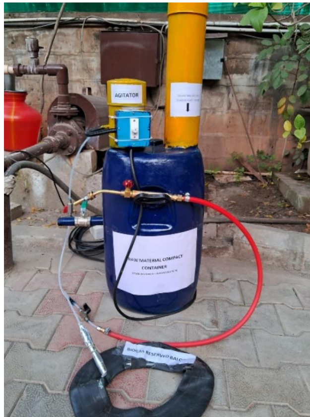
Figure 2: Prototype 1

By February 2024, the feature set (with detailed specifications) of the biogas plant was compiled. In February, when building the first prototype, Prototype 1, I sought the assistance from the lead researcher of Sundaram Climate Institute (SCI, where I am pursuing a part term internship) for buying material and in building the plant. Based on her suggestion, I gave the specification to a local shop to build the plant.